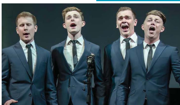
Blindside – 2015 Youth Gold Medal Quartet