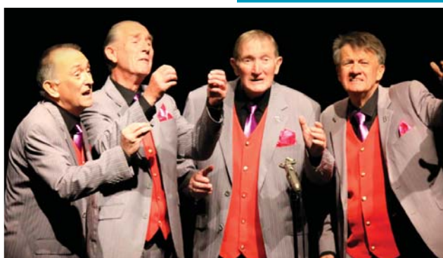
Benchmark – 2015 Seniors Gold Medal Quartet