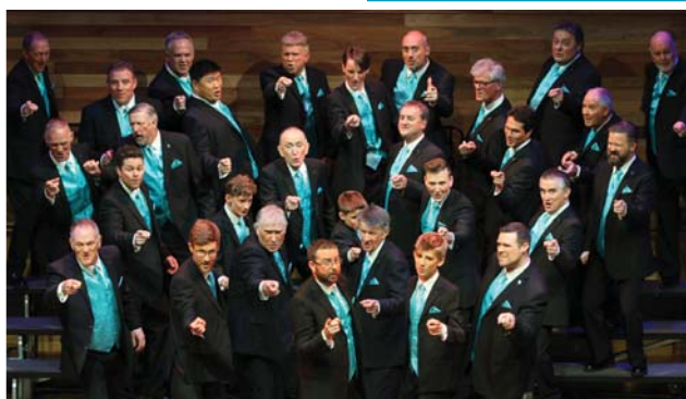
Sound Connection – 2015 Gold Medal Chorus

Want more information? Visit www.barbershop.org.au now!