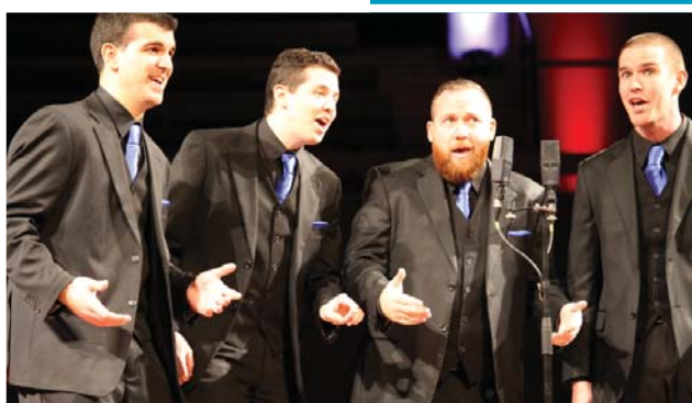
Lockout – 2015 Open Gold Medal Quartet